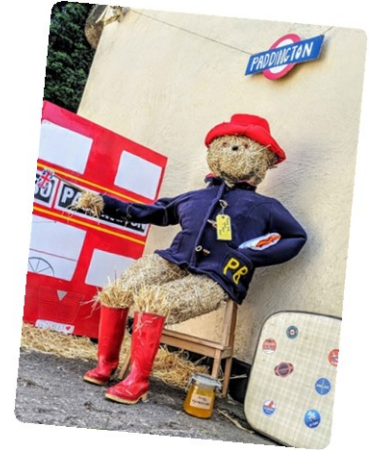
2019 runner up

registration form overleaf or email us at